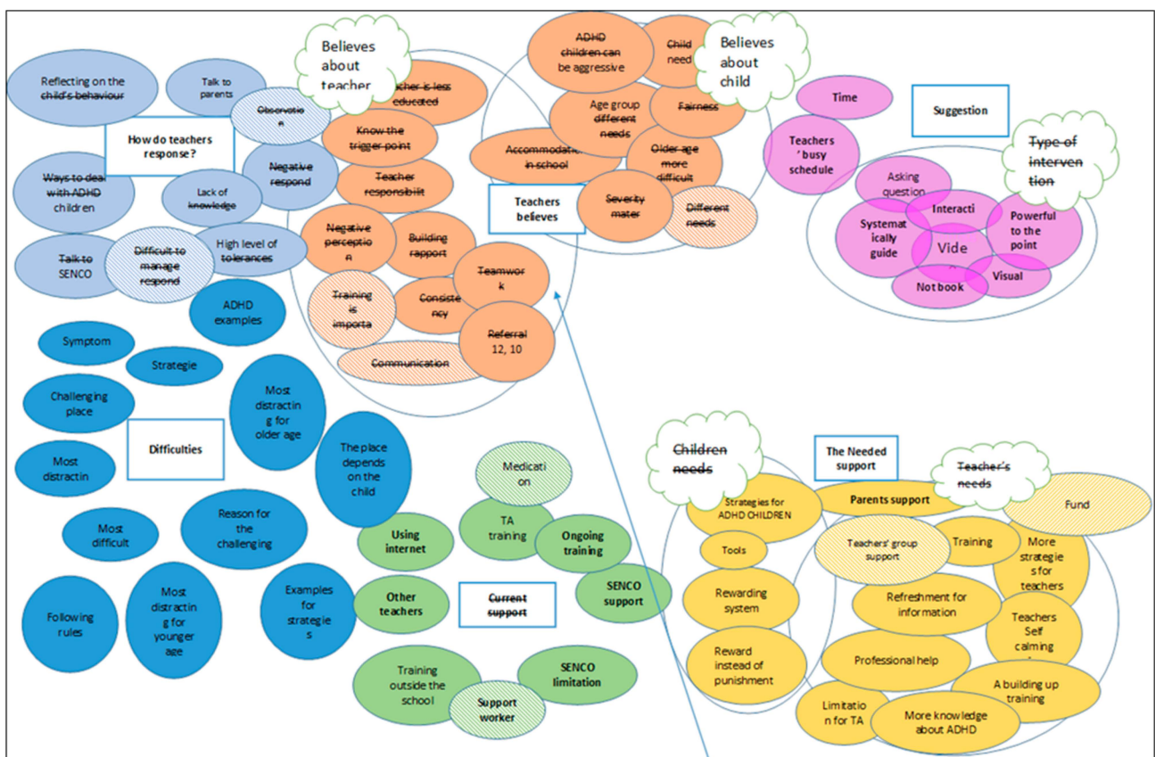
Figure 1. Code mapping.

In this study, reflexive thematic analysis was guided by the social constructivism paradigm. The study focus on finding and reporting consistent dataset patterns that are driven by the research question following the phased approach of Braun and Clark (2006, 2014) which are: familiarising oneself with the collected data, initial code identification (see Figure 1), theme development, theme reviewing, theme refining and naming, and generating the report. Reflexive thematic analysis was used inductively and aimed to capture meaning at the latent and manifest level seeking to identify recurrent concepts among transcripts [44,45].